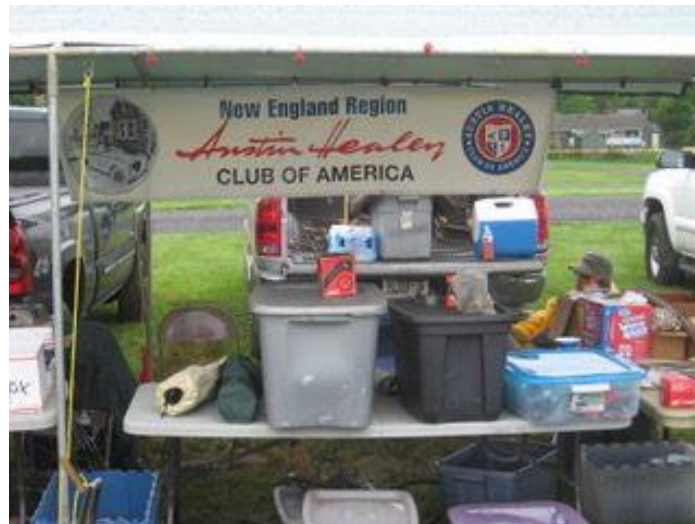
Setting up the site and proudly displaying the club banner

It's hard to tell who's who with the mask requirements