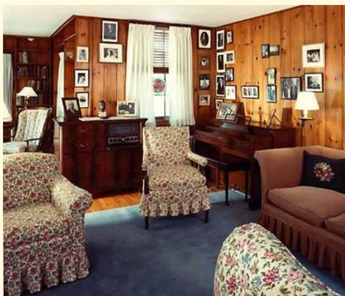
Eleanor Roosevelt's study

The building was renovated and expanded to include seven bedrooms, a swimming pool, two large porches, a children's playhouse, and more. The nearby stone cottage was part of the grounds.