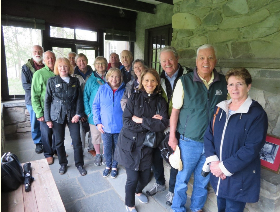
The Val-Kill Visitors L-R

From there we drove two miles to the CIA (Culinary Institute of Arts) for lunch and lively conversation. Each dish was artfully presented and delicious. Wine excellent. Atmosphere relaxing. And we learned about a new red blend wine called Eaten by Bears!