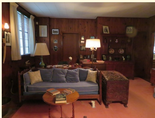
Eleanor Roosevelt's living room

The shop made high quality replicas of early American furniture. The company continued until 1936 when Eleanor and her friends dissolved the business. One of the craftsmen was given the equipment and he continued the business on his own in another location.