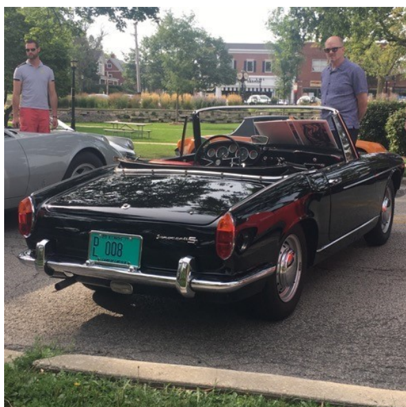
A very good example of an Innocenti Spider "S" version.

The morning of our first day was spent walking through two expansive buildings that were home to beautiful and expensive cars for sale. The sellers were usually auto brokers with arm chairs, bars, desks with plenty of brochures, showcasing several cars for sale in their "area". Not what I had envisioned when I started out that day. Amongst these cars I found 4 Austin Healeys for sale, a 100-6, two 3,000's and a Bugeye Sprite. You could enjoy a glass of wine while sitting and chatting about their cars for sale, as I did with all of the Healey brokers, but I was a little disappointed in that most did not really "know" the cars, but appeared to be in it for the profit.