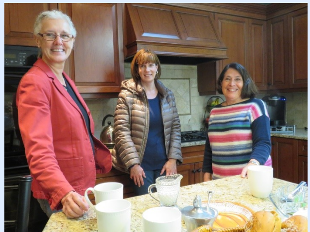
Some of the women hanging out in the kitchen →