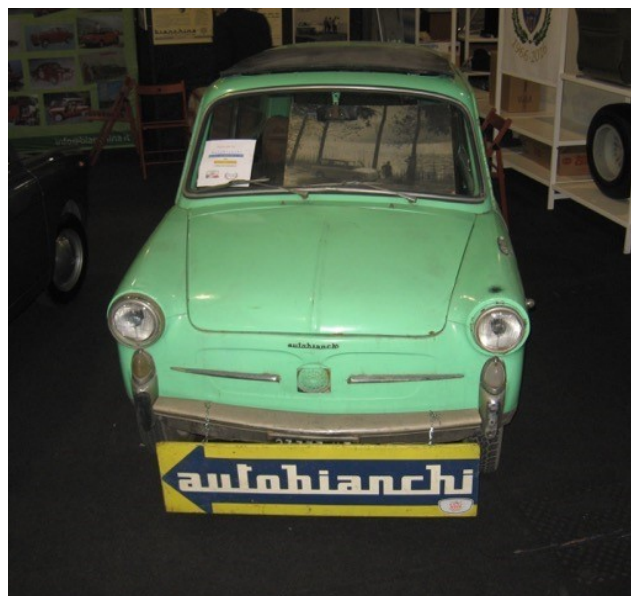
Autobianchi one of the many small cars, one and two-seaters, seldom seen here in the USA