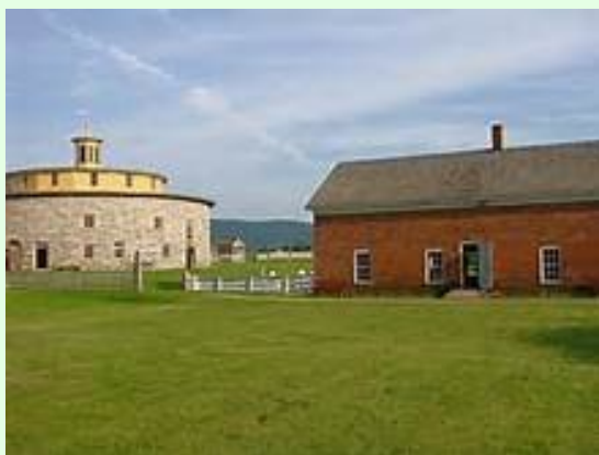
Hancock Shaker Village