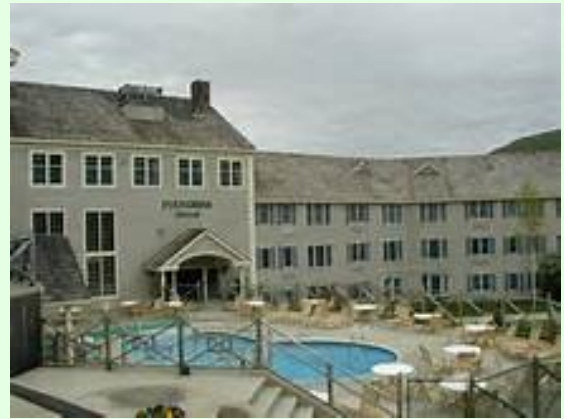
Jiminy Peak Mountain Resort