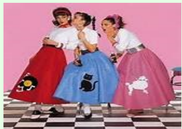
Roll Back in Time Sock Hop