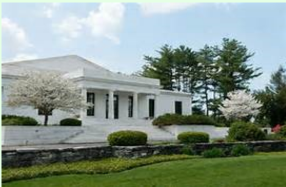
Clark Art Museum