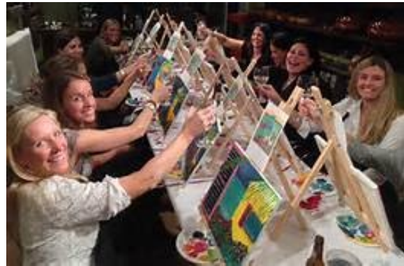
Paint Party with Instructors