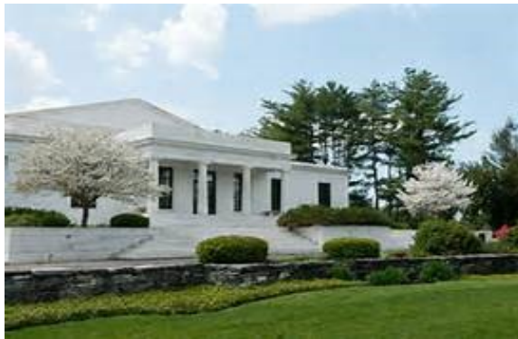
Clark Art Museum