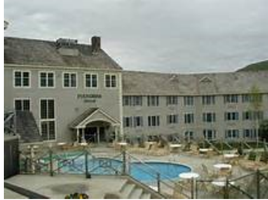
Jiminy Peak Mountain Resort