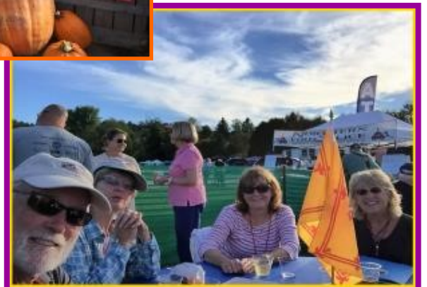
September 2016: A few clouds at the British Invasion in Stowe, VT, did not bother anyone—everyone was all smiles.