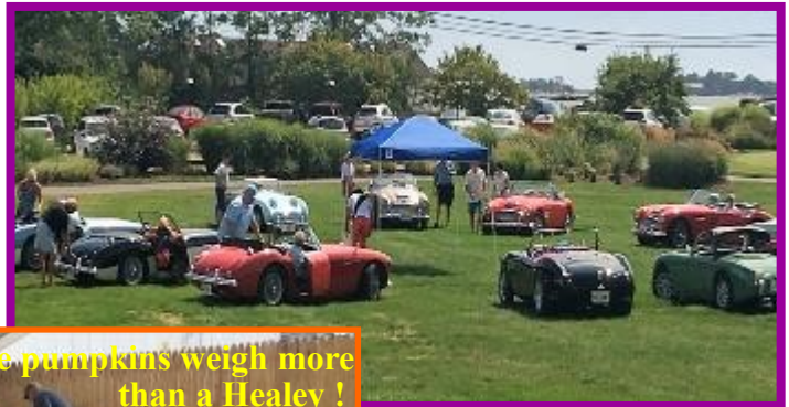
These pumpkins weigh more than a Healey !