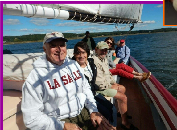
September 2016: The CT River Rally, Cruise on a classic schooner and Lunch was a hit !