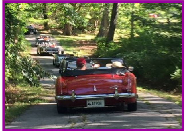
August 2016: The Thimble Islands Cruise & lunch at Pine Orchard Country Club delighted many members. ↓