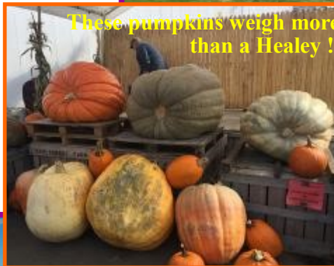
October 2016: Great time to cruise to AppleCrest Farm Festival in Hampton Falls, NH