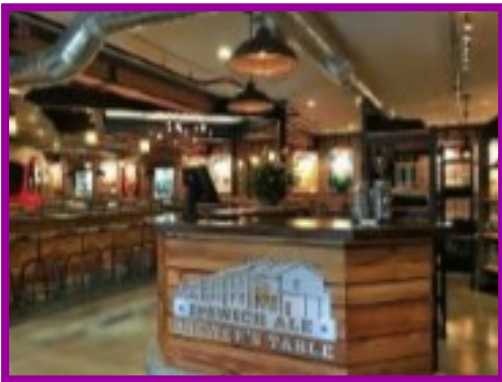
August 2016 brought us the Cape Ann Rallye and Brewery Tour