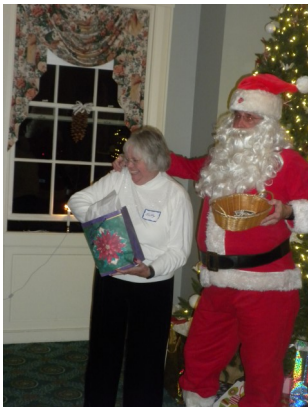
Our very own Santa & Mrs. Claus