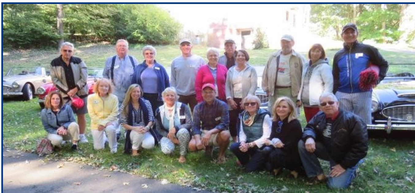
A happy group of Healey members, all smiles after a great day on and along the Connecticut River.

Thank goodness for the weather-gods, the day was a success and most importantly, no one was separated from the group!