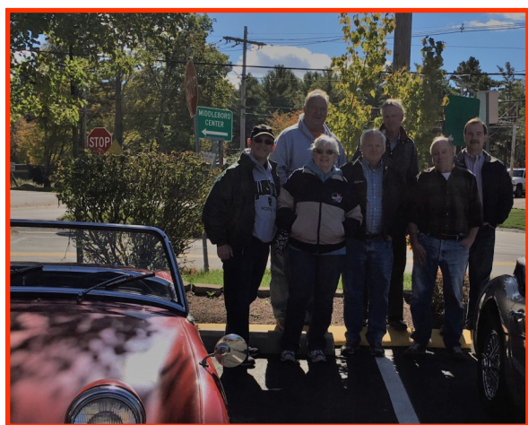
HEMRI members pose for a group picture

Read more on PAGE # about the next gathering of HEMRI on Saturday, November 19th , a breakfast gathering at Good Days in West Bridgewater, MA.