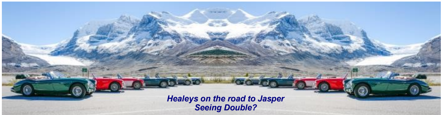
Healeys on the road to Jasper Seeing Double?