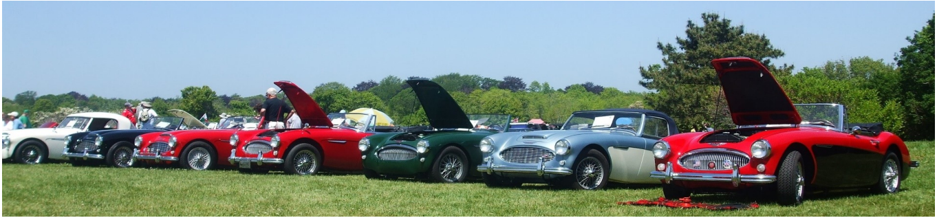
British By The Sea gathering at Harkness Park, Waterford CT