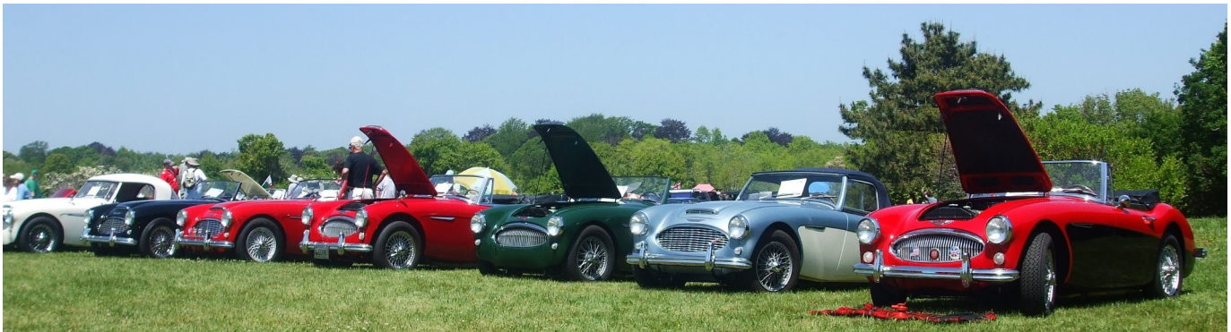
British By The Sea gathering at Harkness Park, Waterford CT