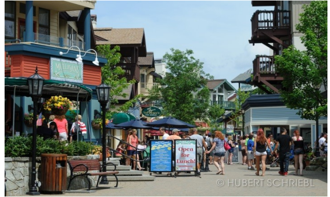
Stratton Mountain and Village