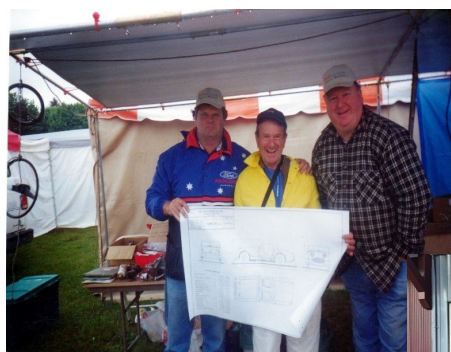
Attendants from recent Carlisle Events are having a great time !