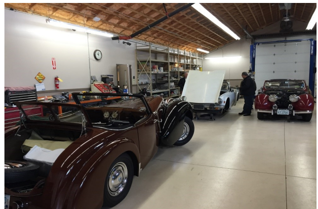
Triumphs at the Historic Motor Sports shop: Two Triumph 2000 roadsters and a TR-6.

You can call these folks to be sure they e-mail you about the next cars & coffee get together date, which is scheduled for March 12th.