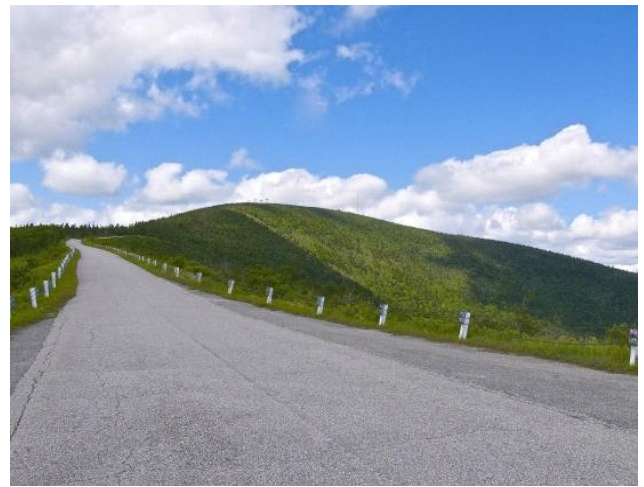
Mt Equinox Skyline Drive