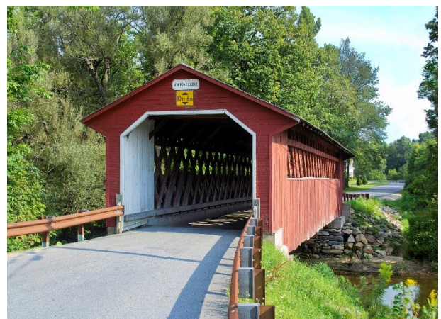
One of the covered bridges on Thursday's tour