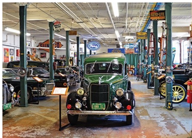
Hemmings Auto Museum