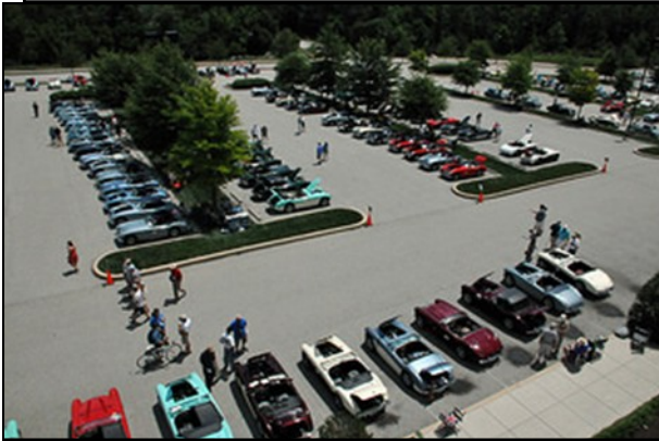
Car show field at Enclave