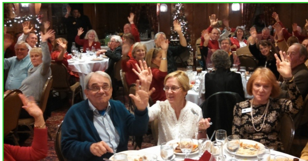
The party gets rock'in. Dinner is served.