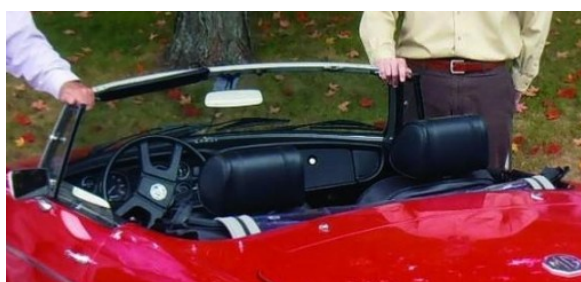
Ready for delivery back to Good News Garage