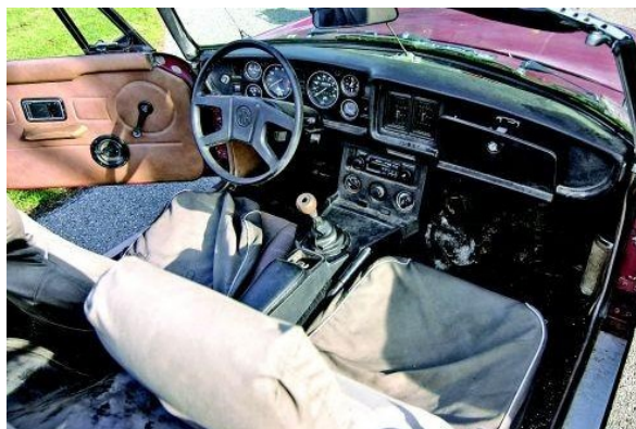
1980 MGB as received from Good News Garage with tired exterior and tattered interior