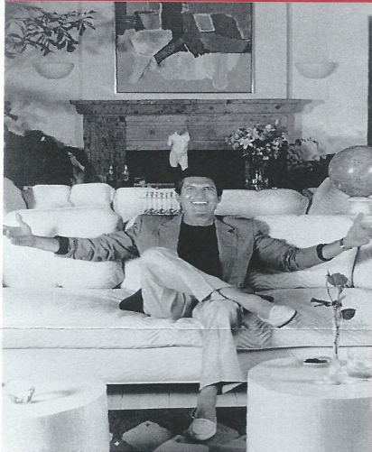
...visit his home