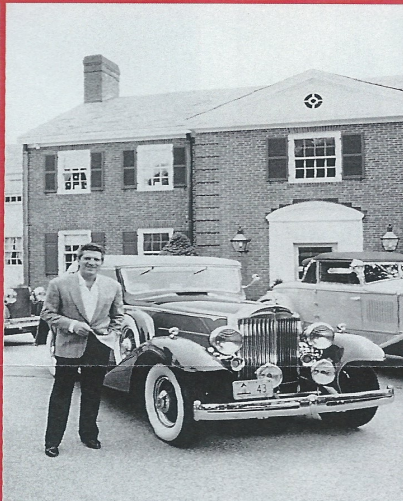
...view his antique cars