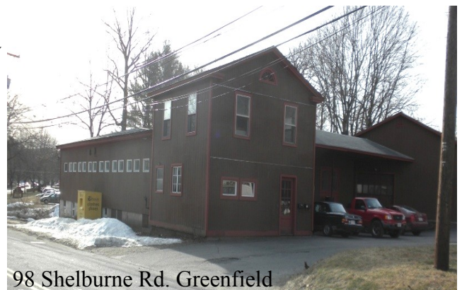
98 Shelburne Rd. Greenfield

From North .... I - 91 South to Exit 26 and follow instructions for East above