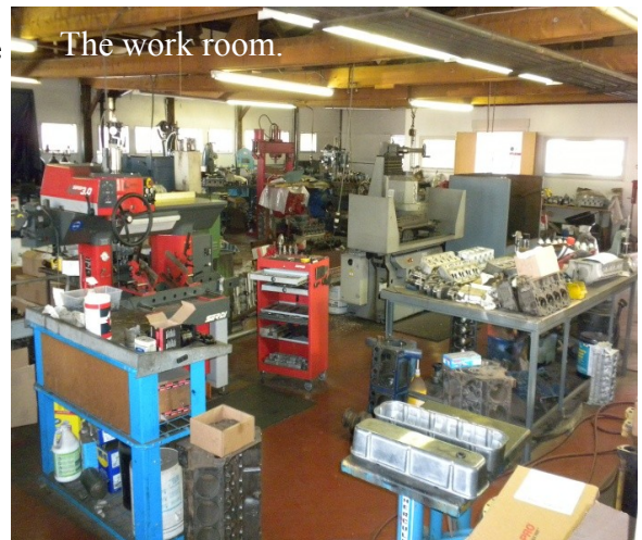
The work room.