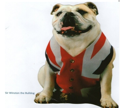
Sir Winston the Bulldog