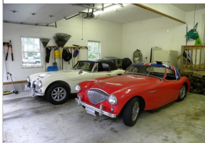
Duane Walzer's 100 Randy Hicks BJ8