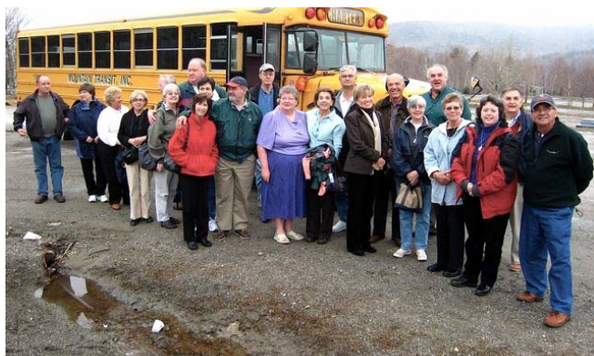
Your Conclave Committee with its overheated school bus stranded on the uphill slalom course at Bolton Valley.