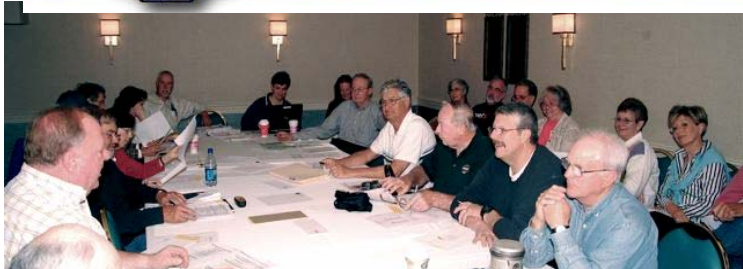
Your Conclave Committee hard at work in the April 28 planning session in Burlington VT.