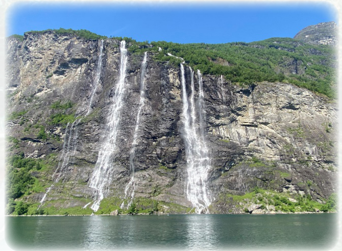
The Seven Sisters

On the final day of the meet, we boarded a tour boat at the head of the Geiranger Fjord for a trip down the fjord to view a number of waterfalls. With snow covering these mountains year round the waterfalls never dry up. The most majestic of the falls is known as the Seven Sisters as there are 7 falls next to each other all cascading down the steep mountain side.