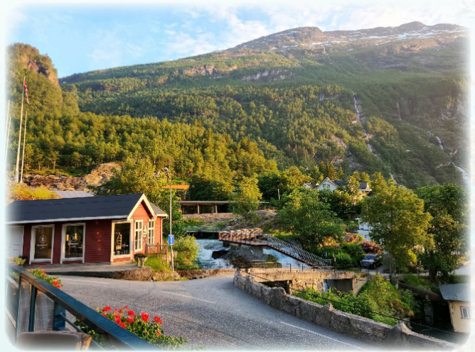
9:45 PM in Geiranger

One thing which we had to get used to during our stay in Geiranger was the 20 hours of daylight. This made it challenging to sleep at night, even with blackout curtains, as we needed to keep the curtains in our room cracked open a bit to get the fresh mountain air.