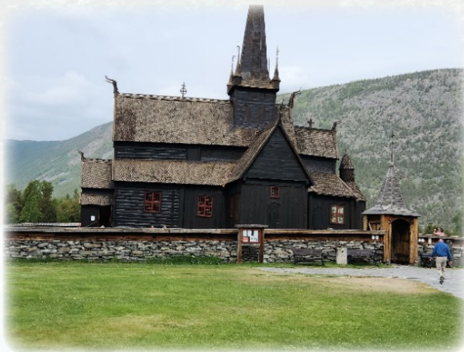
The Stave Church

The next day we were off for a long trip to Geiranger for the start of the European Healey Meet. Along the way we stopped at the Stave church in Lom, Norway for a private tour. This wooden church built with pine and oak timbers was erected in 1170 and is still standing strong.