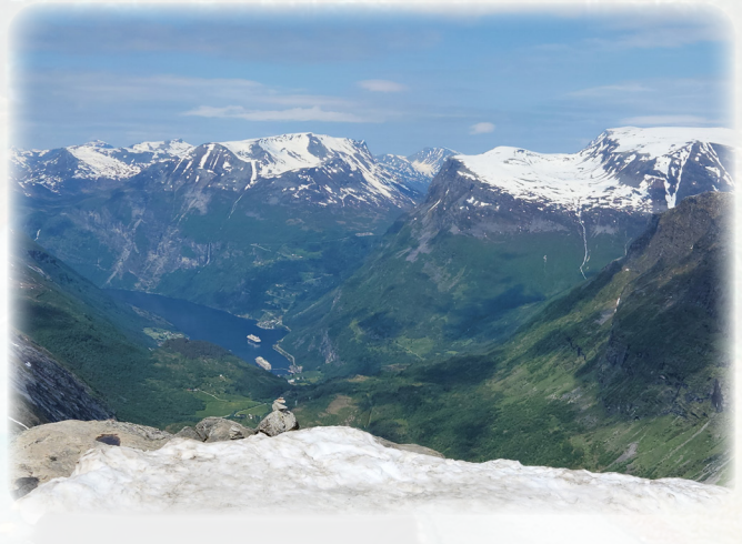
The view from the skywalk, 4900' above sea level

After the car show we were free to drive up to the Dalsnibba Skywalk, which is situated 4900 feet above sea level. It is the highest drivable viewing point of any of the fjords in Norway. The views overlooking the Geiranger Fjord, and the valley below were just stunning.