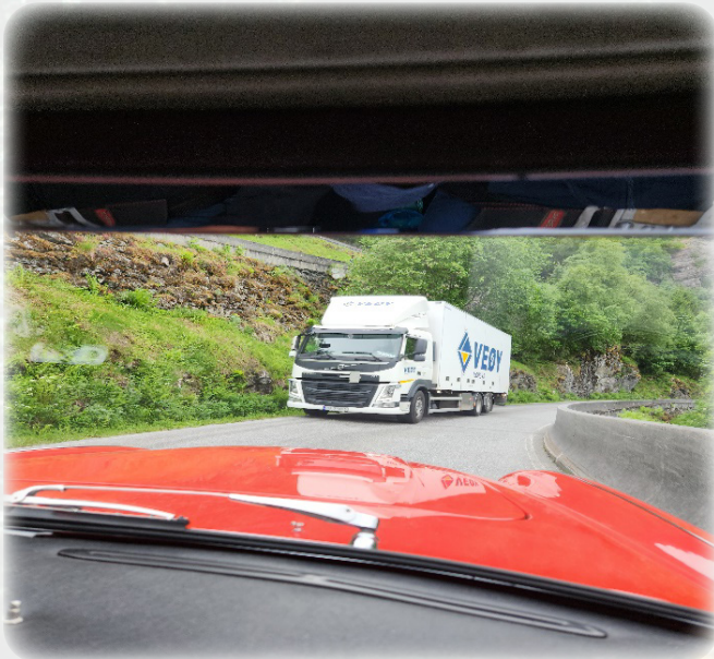
A tight squeeze

As this was a very busy road we had to be vigilant when approaching the many turns as we were sharing the road with campers, tour buses and an occasional tractor trailer.