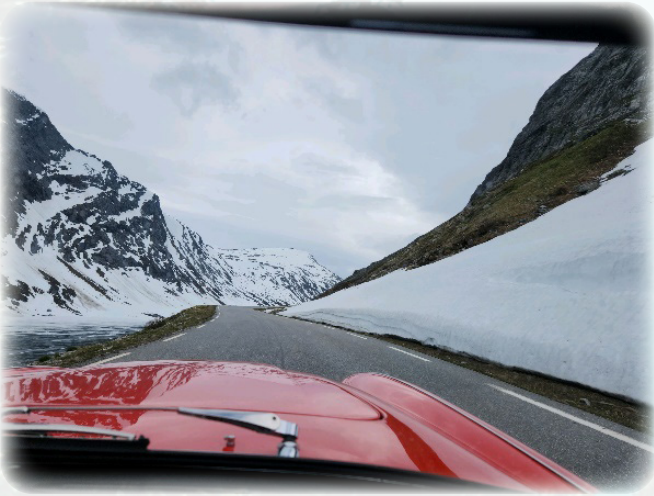
Snowbanks along the way to Geiranger

The European Healey Meet was based in the fabulous Union Hotel overlooking the most spectacular Geiranger Fjord. The meet ran 5 full days with a variety of events including of course a car show, various rally's that took us up stunning mountain roads and lush valley's, gondola rides to the top of majestic mountains, a boat tour along the Geiranger Fjord to view rushing waterfalls and of course the grand banquet dinner. We were lucky to get a room in the host hotel as many in our group had to stay in another hotel down the road from the Union. The food was excellent, especially the buffet breakfast and dinners. Linda counted 28 options for dessert one night! Oh, weight gain was inevitable!