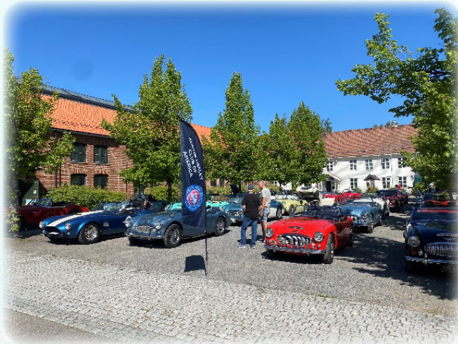
Healey Car show at the glass factory.

Along the way to Lillehammer, we stopped at a glass factory for a tour and to join a local club's car show. The local car club was the Norwegian American Car club. Seems American classic pony cars are popular in Norway. We enjoyed chatting with our fellow car enthusiasts.