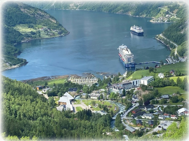
Overlooking our hotel and the fjord

The European Healey Meet was based in the fabulous Union Hotel overlooking the most spectacular Geiranger Fjord. The meet ran 5 full days with a variety of events including of course a car show, various rally's that took us up stunning mountain roads and lush valley's, gondola rides to the top of majestic mountains, a boat tour along the Geiranger Fjord to view rushing waterfalls and of course the grand banquet dinner. We were lucky to get a room in the host hotel as many in our group had to stay in another hotel down the road from the Union. The food was excellent, especially the buffet breakfast and dinners. Linda counted 28 options for dessert one night! Oh, weight gain was inevitable!