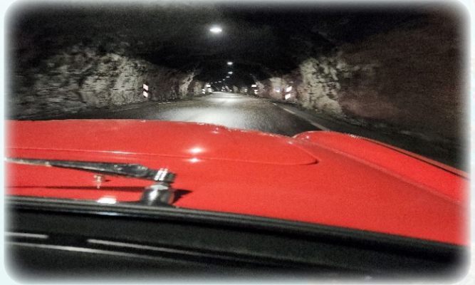
The tunnel to Tafjord

tour. This event was held in Tafjord and required a ferry ride across one of the fjords as well a drive through one of the darkest and narrowest tunnels we encountered in Norway.