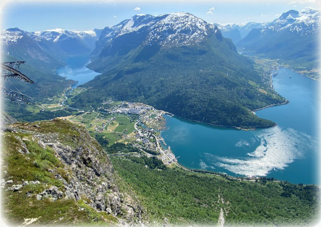
The view from the Leon Skylift

On the second day of the meet, we headed back up the mountain past the Dalsnibba skywalk and continued for another 60 miles or so through numerous tunnels, one which was 7 miles long, and spectacular valleys along several fjords to ride the Leon Skylift to the top of Mt Hoven. This skylift is one of the steepest lifts in the world and ascends from the fjord below almost straight up 3300 feet with only one tower the entire distance. This is not a ride for those with even a mild case of acrophobia. At the top we enjoyed a private luncheon at the mountain top restaurant featuring a delicious reindeer stew before setting out hiking along the many trails on top of Mt Hoven to take in the majestic vistas. The ride down in the skylift, especially for those who had front row views, was quite impressive as well. A day to remember before heading back to Geiringer to get ready for the BBQ dinner at the hotel.