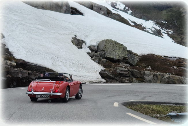
The drive down from the Skywalk

On the second day of the meet, we headed back up the mountain past the Dalsnibba skywalk and continued for another 60 miles or so through numerous tunnels, one which was 7 miles long, and spectacular valleys along several fjords to ride the Leon Skylift to the top of Mt Hoven. This skylift is one of the steepest lifts in the world and ascends from the fjord below almost straight up 3300 feet with only one tower the entire distance. This is not a ride for those with even a mild case of acrophobia. At the top we enjoyed a private luncheon at the mountain top restaurant featuring a delicious reindeer stew before setting out hiking along the many trails on top of Mt Hoven to take in the majestic vistas. The ride down in the skylift, especially for those who had front row views, was quite impressive as well. A day to remember before heading back to Geiringer to get ready for the BBQ dinner at the hotel.