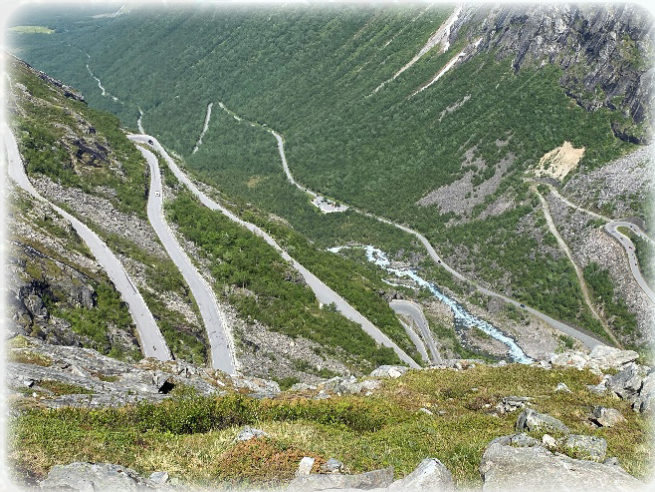
The Trolls Ladder

As this was a very busy road we had to be vigilant when approaching the many turns as we were sharing the road with campers, tour buses and an occasional tractor trailer.