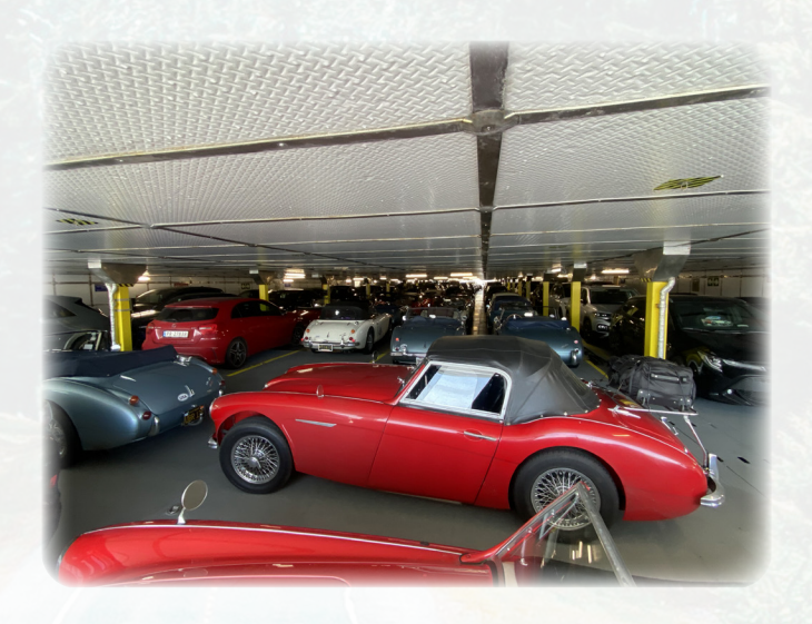
Healey's packed together on the ferry

Denmark here we come. We were off early to catch a 2 ½ hour ferry to cross the North Sea to Denmark and our destination of Aarhus. Aarhus is Denmark's