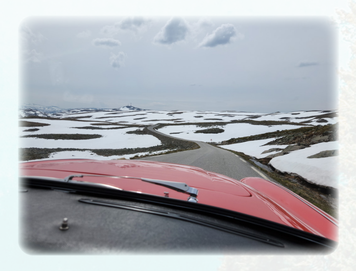
Top of the Snow Road

The road first started out at sea level and quickly climbed through a narrow valley eventually reaching a desolated treeless snow covered landscape 4281' above sea level. This road was just wide enough for one vehicle and had very few guard rails, so we had to be alert at each turn, which was difficult for the drivers as the scenery was so majestic. During the entire 29 mile drive we did not see any other cars on the road. After a long descent we entered Flam and headed to the hotel's bar for a well deserved beer or two. We enjoyed dinner at a local brew pub which featured a delicious New England style IPA beer.