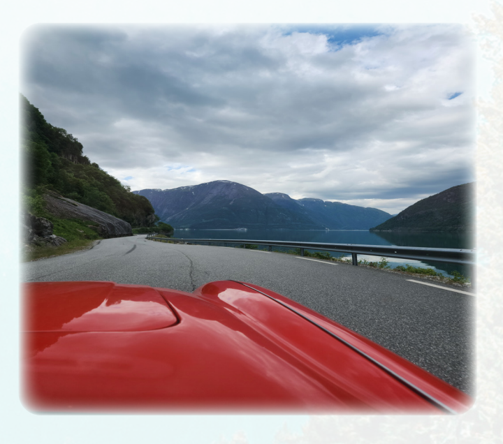
The beautiful Setesdal valley

The next day we headed south through the remote Setesdal Valley with sod roofed homes, ancient churches, derelict farmhouses, and gentle scenery. Our destination was the portside city of Kristiansand, our gateway to Denmark.