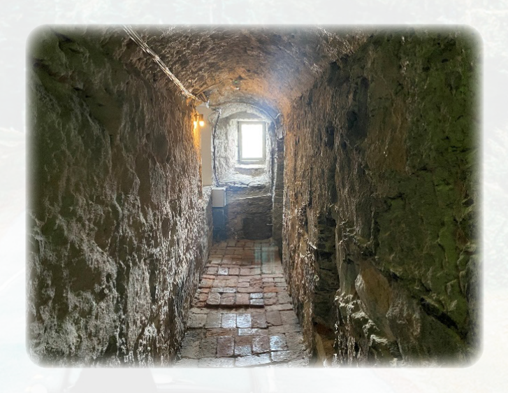
One of narrow passageways in the Rosenkrantz Tower

The next day we headed to the seaside port of Bergen, founded in 1070, which once was the capital of Norway back in the 13th century. Bergen has many historic buildings including the Rosenkrantz Tower, located right next to our hotel. It dated to 1270 and was the residence and fortress of the Norwegian king in the 13th century and later the home of Governor Erik Rosenkrantz who expanded the residence in the 16th century. With narrow winding passageways it was an intriguing building to tour, including the torture chamber in the lower level.