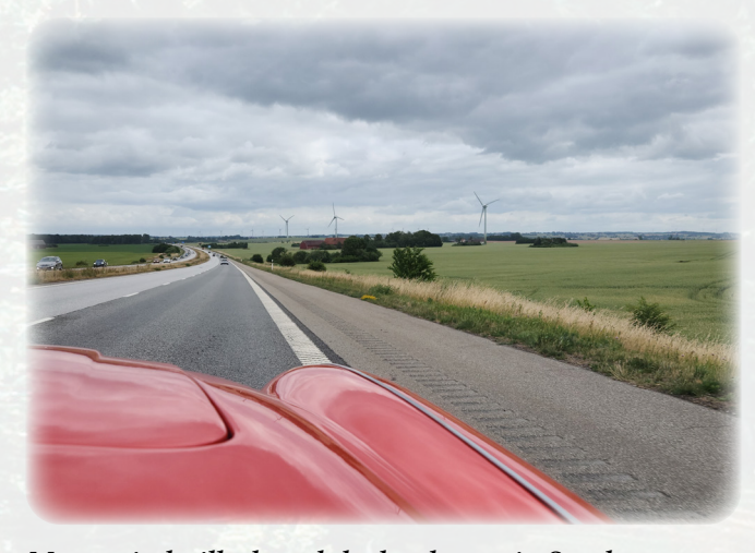
Many windmills dotted the landscape in Sweden.

The next few days we traveled across Denmark with the first night stay in Odense, birthplace of Hans Christian Anderson. Compared to the rural and mountainous terrain of Norway, Denmark was mostly flat with huge fields of wheat and other crops and many, many windmills providing the country's power.