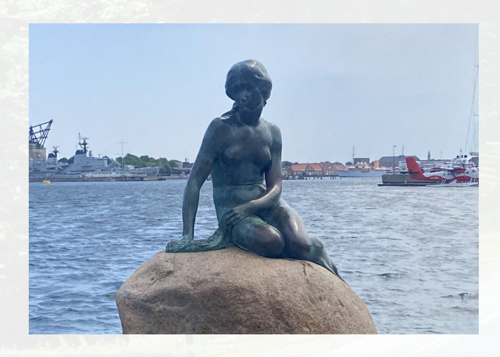
The famous Little Mermaid

Ah, Copenhagen. So much to do, so little time. With only one day to explore we decided to get some exercise and take a 3+ hour walking tour of the city, eventually ending up at the famous Little Mermaid on the rock. We were hoping to visit the famous Tivoli Gardens in the afternoon but with threatening thunderstorms we headed back to our hotel. One thing that was quite different from major US cities was the number of folks riding bikes thorough the streets alongside cars in dedicated bike lanes.