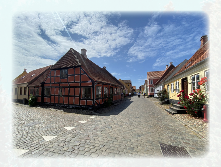
The main street in Areo

With an extra day in Odense, Linda and I opted to take a ferry out to the island of Aero, the "Nantucket" of Denmark, located in the Baltic Sea with its old stone cottages along narrow cobblestone streets. We stopped at a small museum to view the world's largest collection of ships- in- a- bottle, more than 1000 in total all created by one man over a lifetime. Time allowed us to take an island tour on the free island bus before we had to catch the ferry back to Odense.