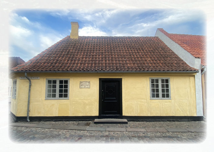
Birthplace of Hans Christian Andersen

With an extra day in Odense, Linda and I opted to take a ferry out to the island of Aero, the "Nantucket" of Denmark, located in the Baltic Sea with its old stone cottages along narrow cobblestone streets. We stopped at a small museum to view the world's largest collection of ships- in- a- bottle, more than 1000 in total all created by one man over a lifetime. Time allowed us to take an island tour on the free island bus before we had to catch the ferry back to Odense.