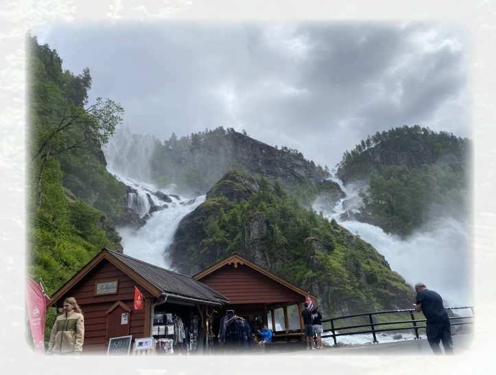
One of Norway's magnificent waterfalls

The following day's journey was a 6 hour drive along numerous fjords and remote valleys to the ski town of Hovden. We passed through another national park with snow covered peaks and numerous waterfalls along the route. Being off season Hovden was noticeably quiet, and we were the only patrons at our hotel for the evening.