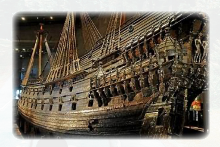
The Vasa War Ship, circa 1627

On day 23 we finally arrived in Stockholm after a wonderful scenic drive compliments of a local Healey club member through numerous inlets along the Baltic Sea and Swedish countryside. We spent the next 2 days exploring this exciting city with so many old and historic buildings in the nearby old town section with its narrow cobblestone streets and of course many outdoor cafes. The highlight of our stay in Stockholm was visiting the Vasa Museum. Vasa was a ship that was built between 1624-27 with a double gun deck, the first of its kind for a man-of-war ship of the period. However, the ship turned out to be too top heavy and sunk in less than 1 mile on its maiden voyage when a gust of wind knocked it over. The ship sat at the bottom of the harbor for 333 years before it was raised and preserved. Over 98% of the original ship survives, making this the most preserved ship of the 17th century. Anyone visiting Stockholm must make it a point to visit this museum.