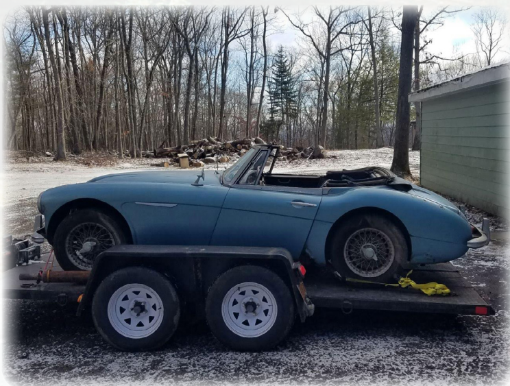
The Crowley's 1964 BJ8