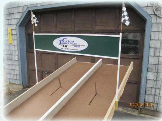
2 classes: 4 cylinders and 6 cylinders