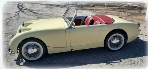
Terence LeVasseur's Bugeye